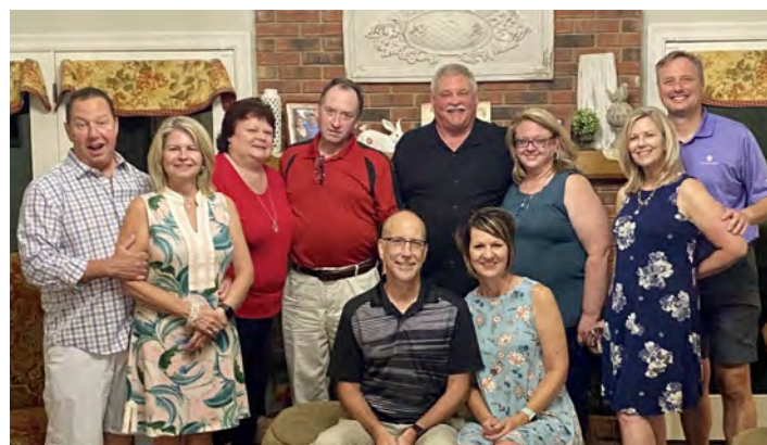
Rork & Sue Swisher's Home