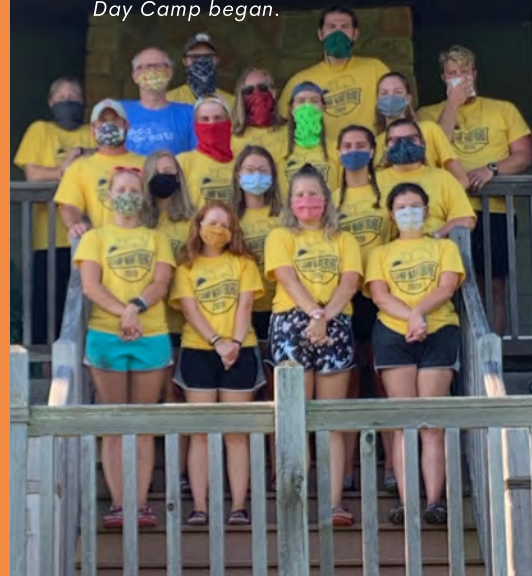
Camp Wartburg 2020 SGLs and Staff:

Our Camp Wartburg staff made the commitment to remain on-site the entire summer after quarantining for two weeks before Day Camp began.